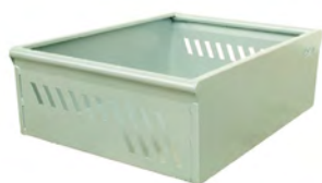
BASKET 730X500XH220 MM