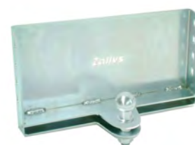
TOWBALL TRAILER HITCH