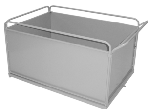
PLATFORM 800X1250XH630 MM