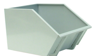
PAINTED SKIP 500 L