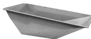
GALVANIZED SKIP 300 L