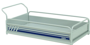
PLATFORM 885X1250XH230 MM